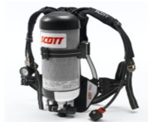
Scott's self-contained breathing apparatus

In the final fiscal quarter of 2007, the Robertson Fire Protection District Board of Directors approved the bidding process and purchase of new self-contained breathing apparatus (SCBA) for the firefighters. SCBA's are the air packs that firefighters wear that allow them to breathe in burning buildings. Our current SCBA's are old and are due to be replaced. After investigating and testing several brands of air packs, the staff and the firefighters have agreed on the purchase of Scott's SCBA's. The firefighters are scheduled to be trained on the new SCBA's later this month and they will then replace our current air packs on all of our trucks and ambulances. The cost of purchasing this new fleet of air packs is nearly $150,000.00. There are many advantages of using the Scott's brand of SCBA, the most important being that they are the most reliable air packs on the market and have more standard safety features than any other brand. Another huge advantage is that all of the surrounding fire departments use Scott's SCBA's as well. This enables fire scenes or disaster scenes to operate much smoother when the equipment is universal.