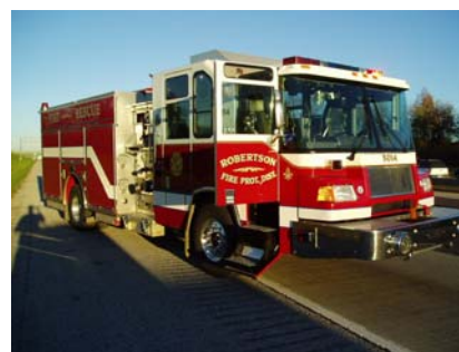
This is Rescue Pumper 5014 stationed at 12641 Missouri Bottom Road.

In 1999 voters approved a bond issue to help build a new Fire Station Two on Taussig Road. The new station was needed to replace the old Fire house 2 on Gist road due to the Lambert Airport expansion project. Funds from the 1999 bond issue sale were also used for the much needed remodeling of our Fire House One and to purchase fire and ambulance vehicles and equipment over the last several years.